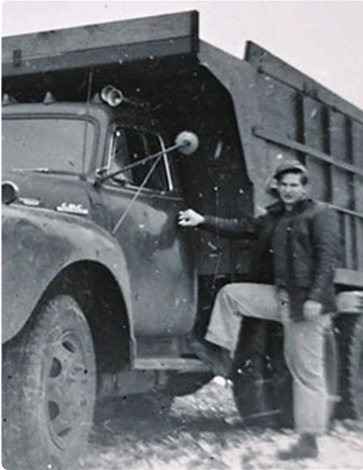
In the beginning ...